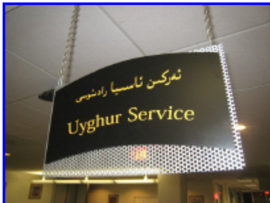
In the newsroom