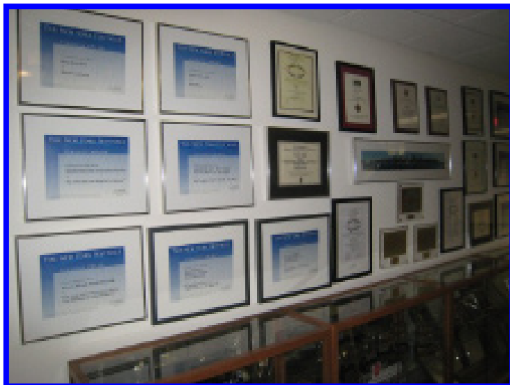
Some of RFA's awards