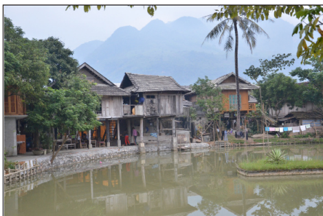
Stilt houses in Ban Lac village, Mai Chau