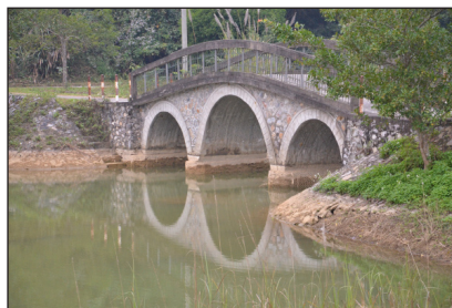
A well known bridge in Cuc Phuong National Park

MC = heard at Ban Lac village, Mai Chau - 27 December 2011