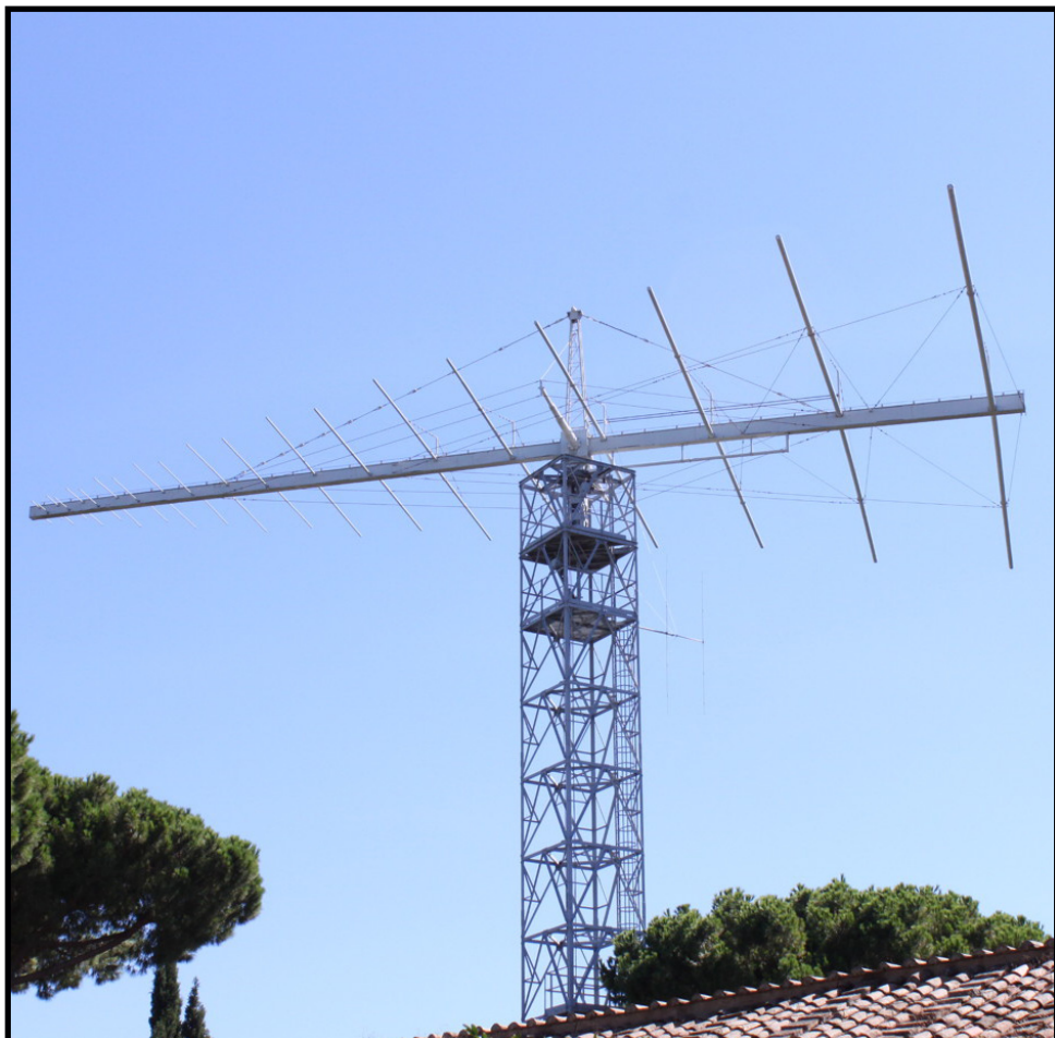
Vatican Radio Transmitter Tower (Vatican City)

Deadline for next issue is Wed 1st Feb 2012 . P.O. Box 39-596, Howick, Manukau 2145