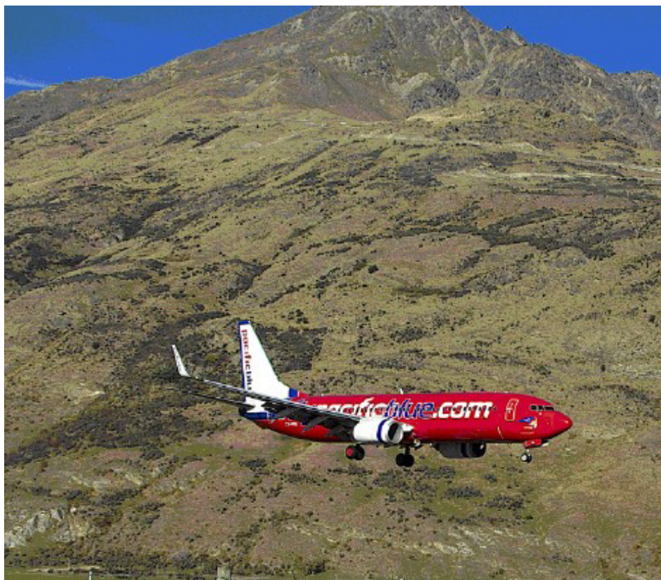
Pacific Blue 737 from Australia landing at Queenstown airport.

www.cromwell-intl.com/radio/frequencies.html