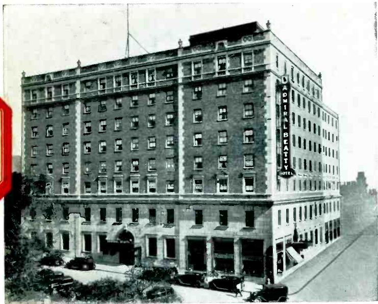
ADMIRAL BEATTY HOTEL, SAINT JOHN, N. B. CANADA