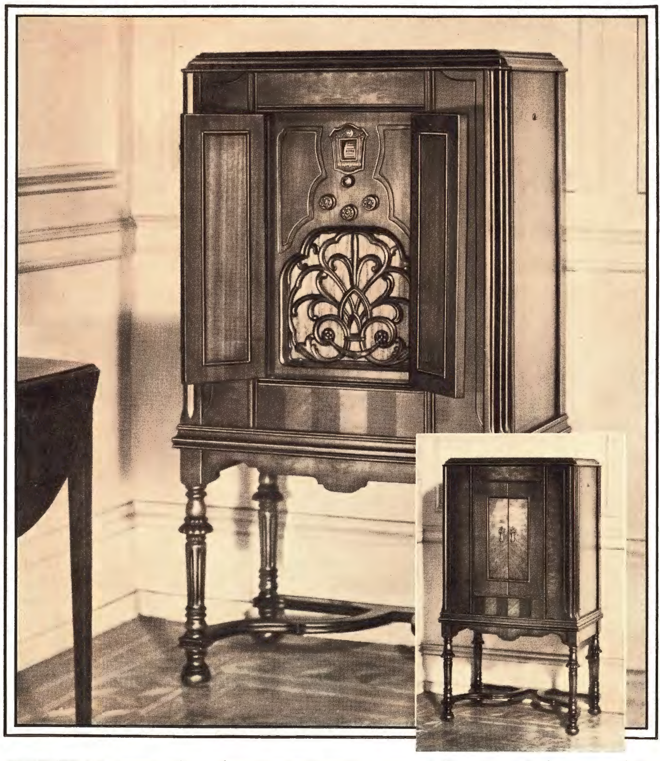
MODEL WR-6 is a screen-grid super-heterodyne with special tone control. The cabinet is Early American design in butt walnut and heartwood; walnut, satin finish. Will also be available with remote control. Size: 48" high, 275/8" wide, 17" deep.