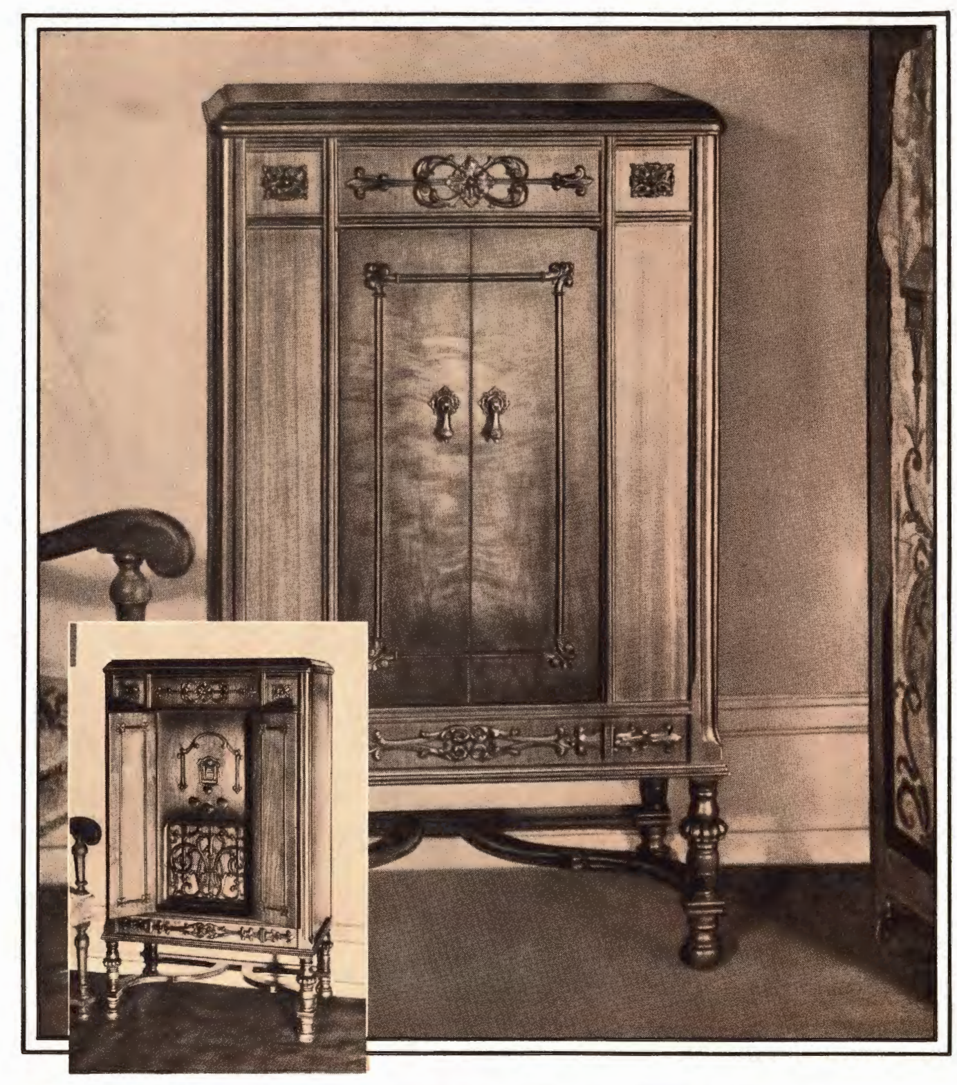
MODEL WR-7 is a combination phonograph-radio, with a special tone-control. Screen-grid super-heterodyne circuit. Cabinet . . . Early American design in butt walnut and heartwood, with walnut finish overlays; walnut, satin finish. Will also be available with remote control. Size: 45" high, 271/2" wide, 18" deep.