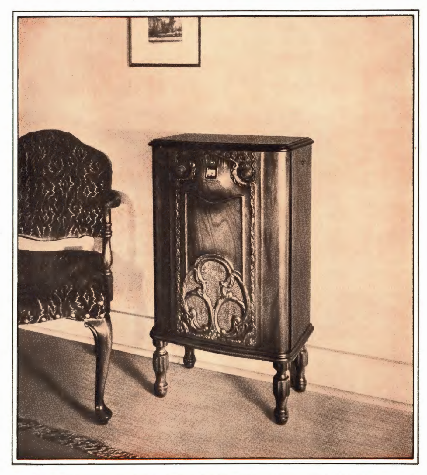
MODEL WR-4 is a lowboy, open faced:—cabinet of Italian Renaissance design, with facsimile hand carving in walnut, satin finish. Screen-grid-tuned radio frequency. Size: 343/4" high, 201/2" wide, 127/8" deep.