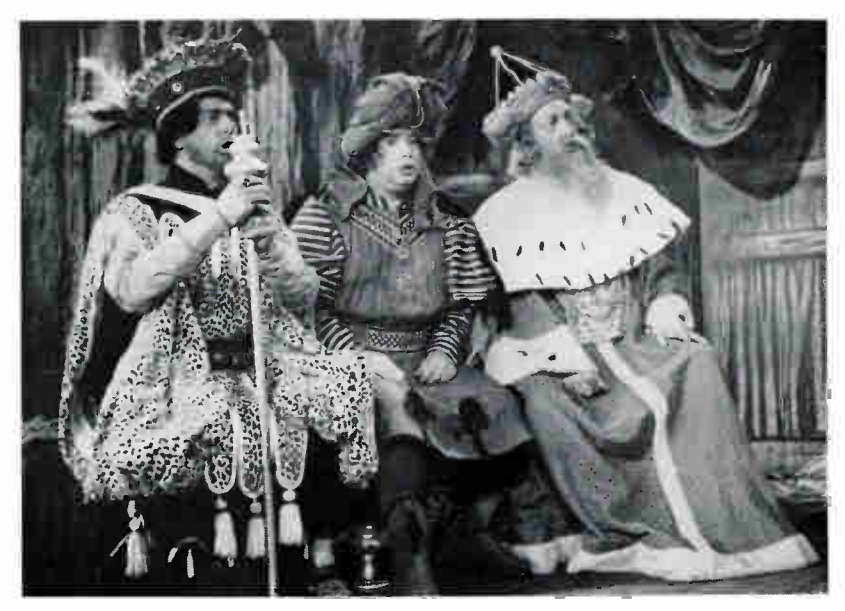
The three wise men of 'Amahl and the Night Visitors' come bearing a gift of traditional Christmas music.