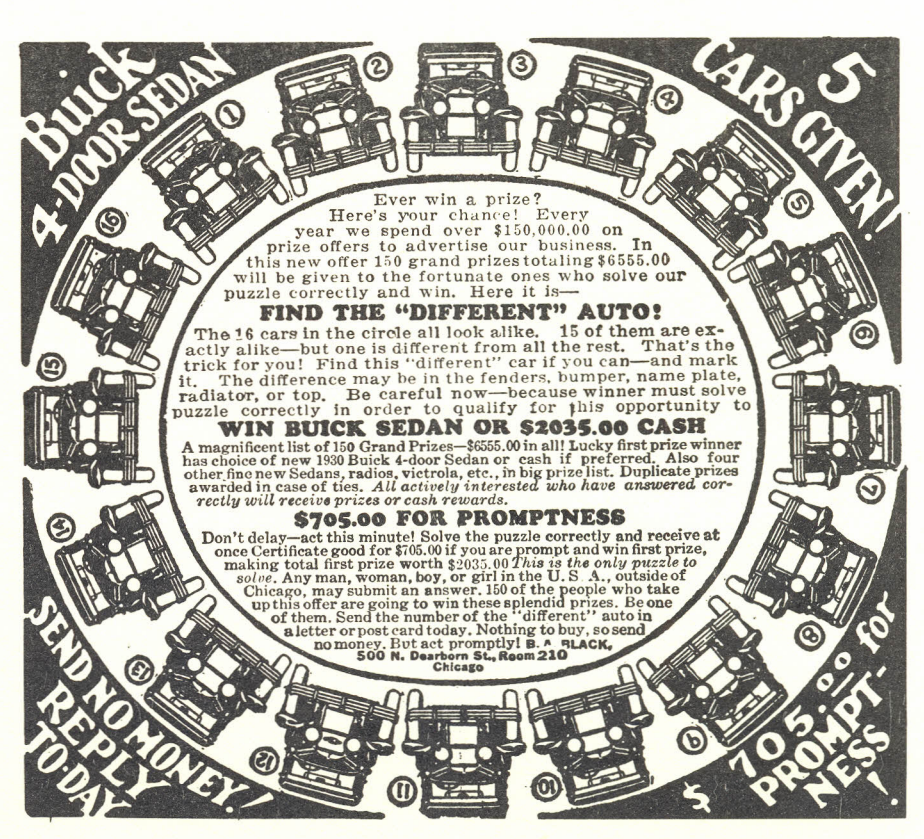
From Radio News, May 1930