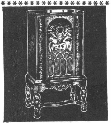
NEW 8-TUBE MAJESTIC SUPER-HETERODYNE chassis in a beautiful Tudorlowboy. Panels of matched butt walnut. Sold complete only with, Majestic tubes, $119.50; $9780 less tubes . . . . .