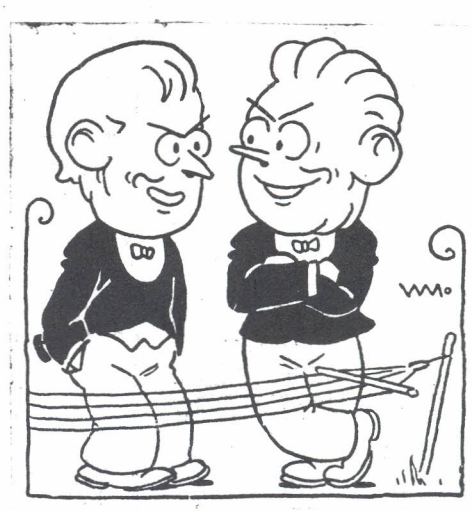
"Why do you use such a low aerial?" "So I can get the low-wave stations bet-

Italian friends of marconi) This to me is the finest cabinet ever crafted, that is, in the choice of select wood. Needless to say I love it, even tho its not batt.operated!!