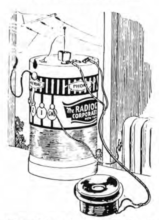
The Simplest Practical Radio Set Made