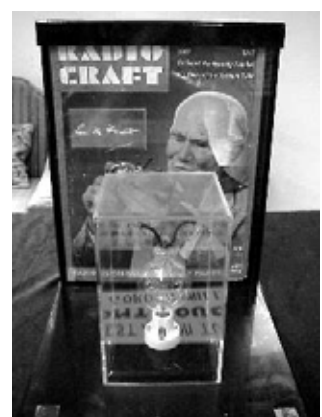
Gordon's tube display