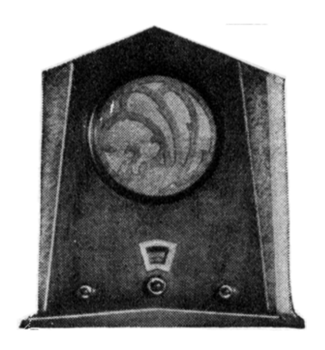
Jackson Bell Company