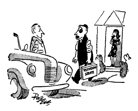
"Poor response, no hold, but very good power pack."