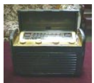
GE 250 - Myron White