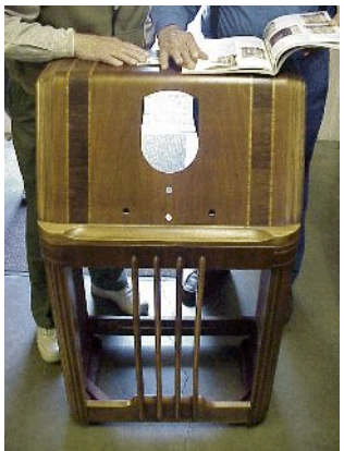
Frank Olberding - Philco 38-3 cabinet

These are the summer projects or acquisitions shown by members at the September meeting.