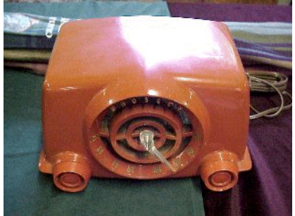
Charlie Kent - Crosley 11-103U