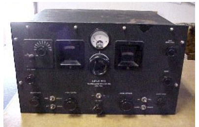
Liles Garcia - Hammarlund 1936 Super Pro