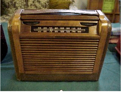
Larry Tobkin - Philco Portable