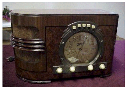
Sonny Clutter - Zenith 6S321