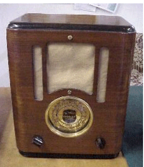
Myron White - 1938 Crosley "Fiver"