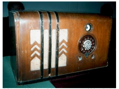
Myron White: Montgomery Ward 6V farm set with sync. vibrator and 150 ma tubes.