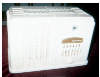
Ed Cook: Airline 62-290 plaskon