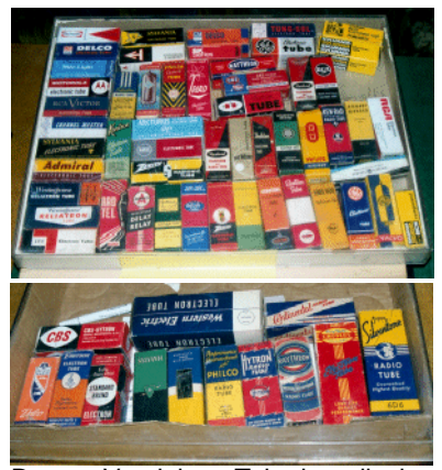
Damon Vandehey: Tube box display