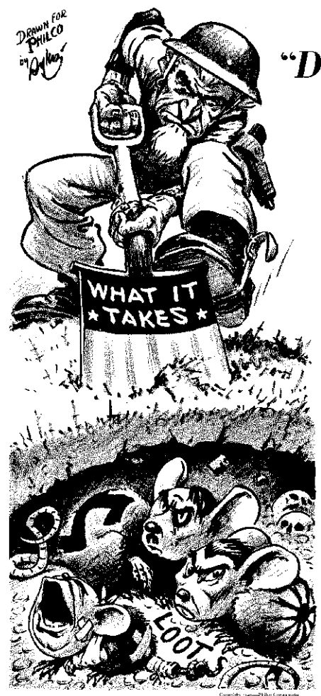
Free Limited Offer ... While available, a full size reproduction of the original drawing by C. H. Sykes will be furnished gladly upon rennest. Simply address