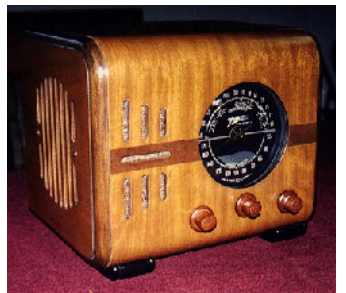
Sonny Clutter - Zenith 5S237