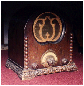
Dave Brown - Unknown Make Cathedral - Paramount?