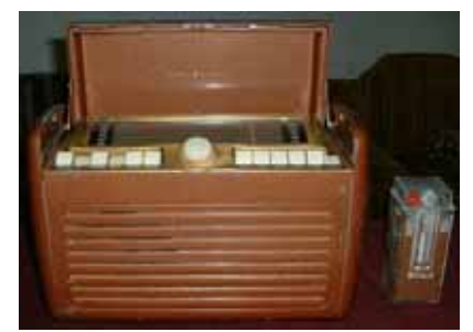
GE 260 w/ rechargable battery Rudy Zvarich