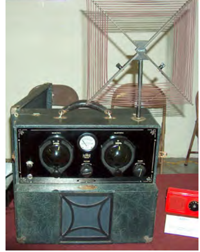
Sonny Clutter - Kemper