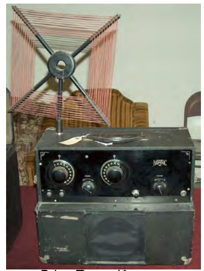
Brian Toon - Kemper