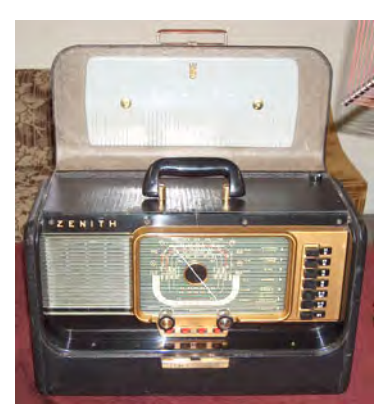
Mystery Owner - Zenith Transoceanic