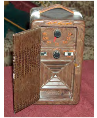
Mystery Owner - Tom Thumb