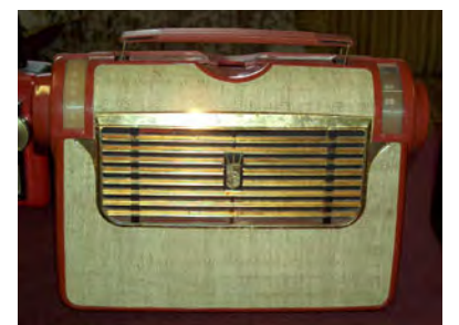
Pat Kagi - Zenith