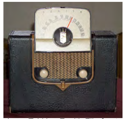
Larry Tobkin - Zenith Flip-front