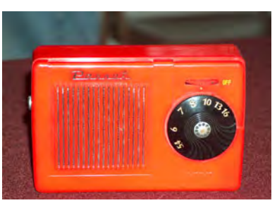
Sonny Clutter Koyo "Parrot" -Japanese