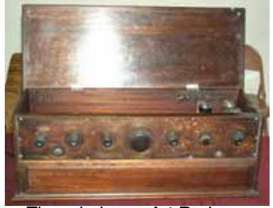
Thermiodyne - Art Redman