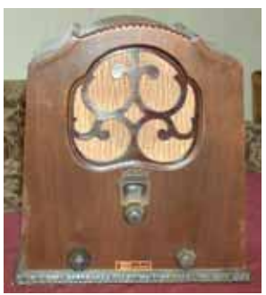
Olympic - Blake Dietze