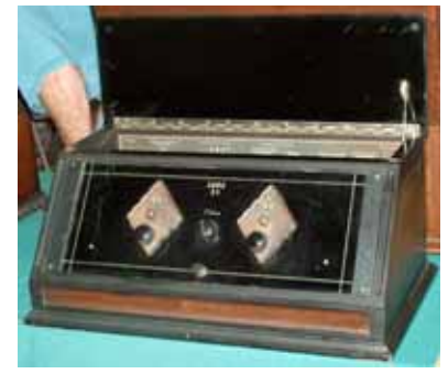
Long-Thompson assembled from parts - Mike Parker