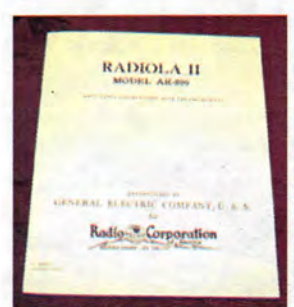
Radiola II Sonny Clutter