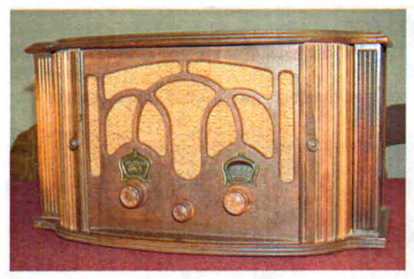
R-28D Tambour table model Jerry Talbott