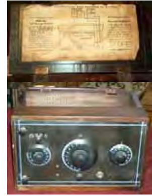
Tri-City W-2 - Blake Dietze