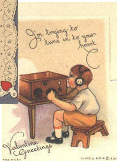
These images were on the February 2001 Call Letter cover.