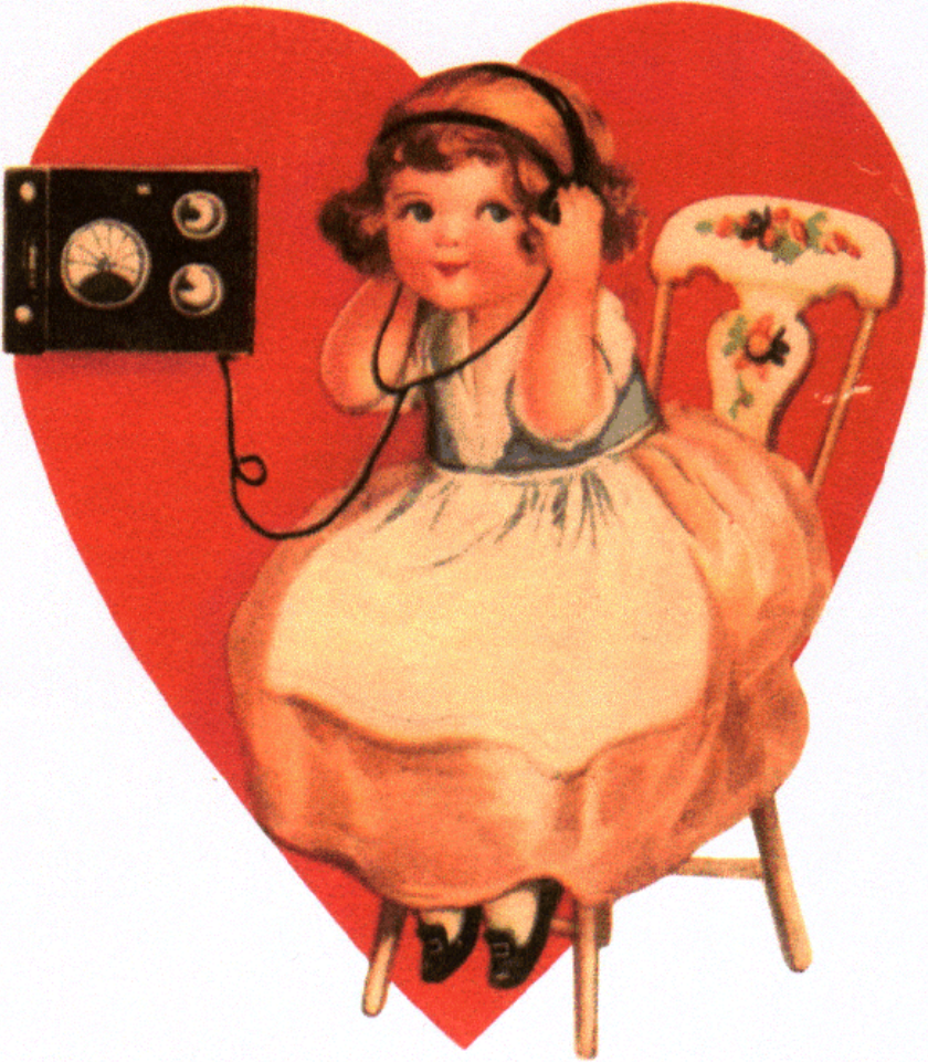
This little cutie was on the February 2002 cover.