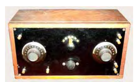
Regen Kit - Dave Brown