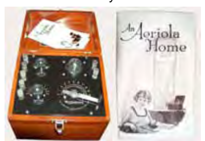
Westinghouse Aeriola & Brochure