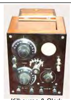
Kilbourne & Clark