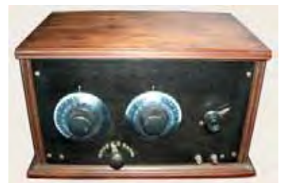
Homebrew or kit