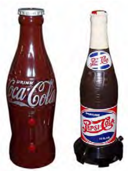
Coke and Pepsi bottle radios