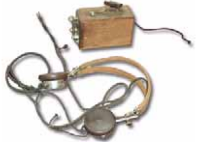
Book, Spark Coil and Western