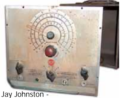
RCA Channelyst UHF converter