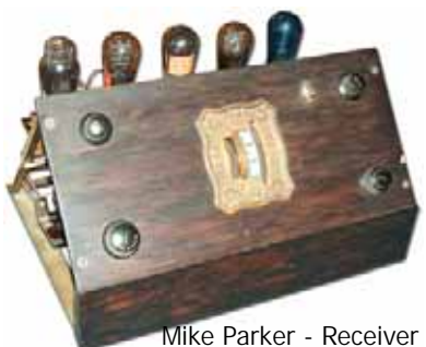
used with All-Aire converter