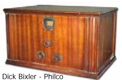
Model 4 SW & TV converter