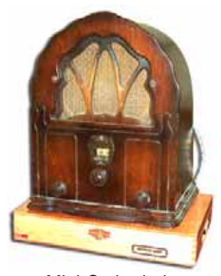
Mini-Cathedral - Dick Bixler