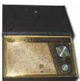
Crosley "Book" radio (Hybrid, 2 transistors, 3 Submini tubes) -Tony Hauser