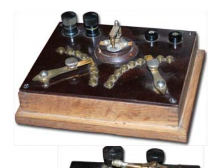
Left - Steinite crystal set; Top right -Unknown crystal set; Bottom right -Crystal detector - Art Redman