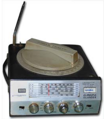
Pierce-Simpson "Gladding" Direction Finder -Norm Trujillo