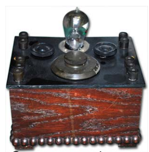
German one-tube set -George Kirkwood