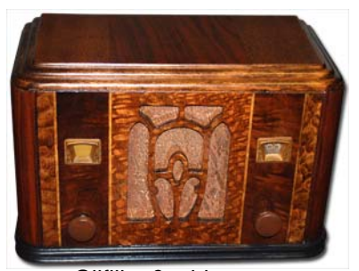
Gilfillan? table set -Alan Shadduck