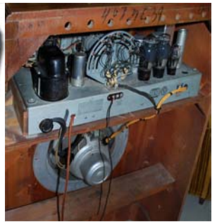
13-tube General Electric console -Sid Saul