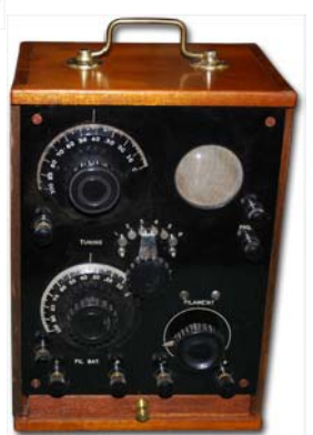
Kilbourne & Clark chassis in microscope case -George Kirkwood