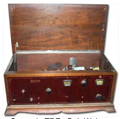
Superola TRF - Bob Walters