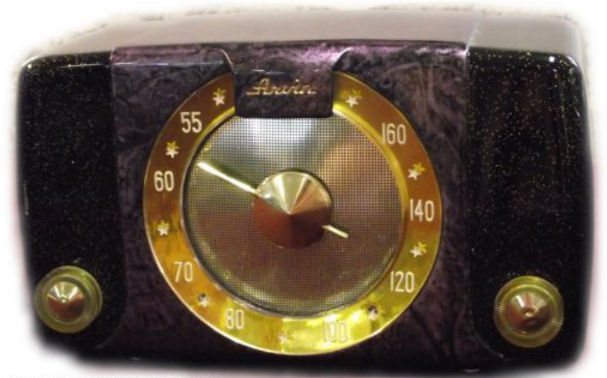
Estaban Mendoza - Arvin 451