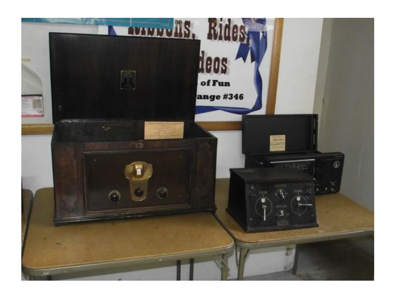
Some of the auction items