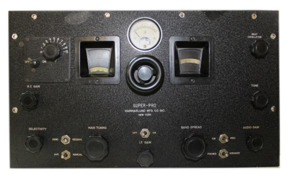
Hammarlund Super-Pro Fourteen Tubes