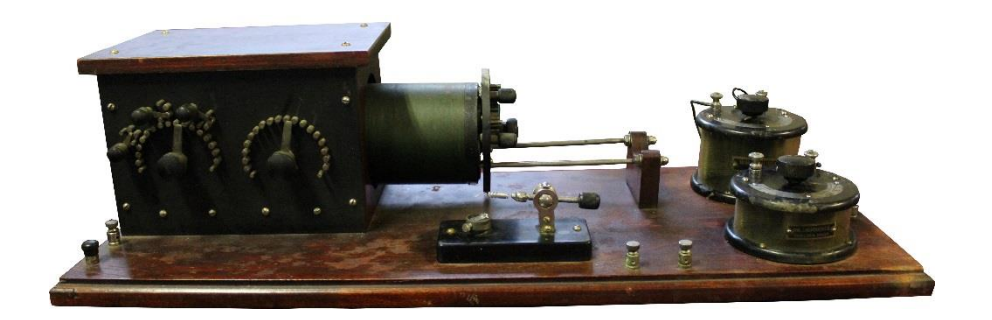
Alan Shadduck – Pre - WW1 Loose Coupler Set