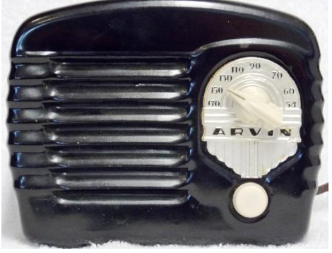
Prewar Arvin 402