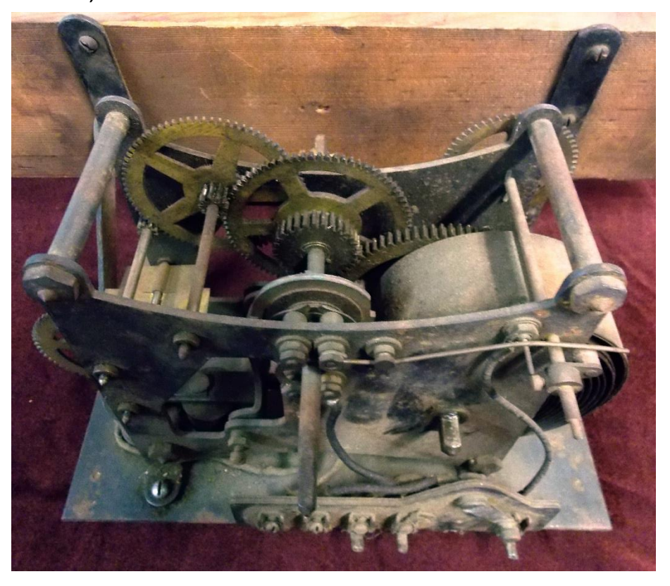
Clockwork Electrical Switch