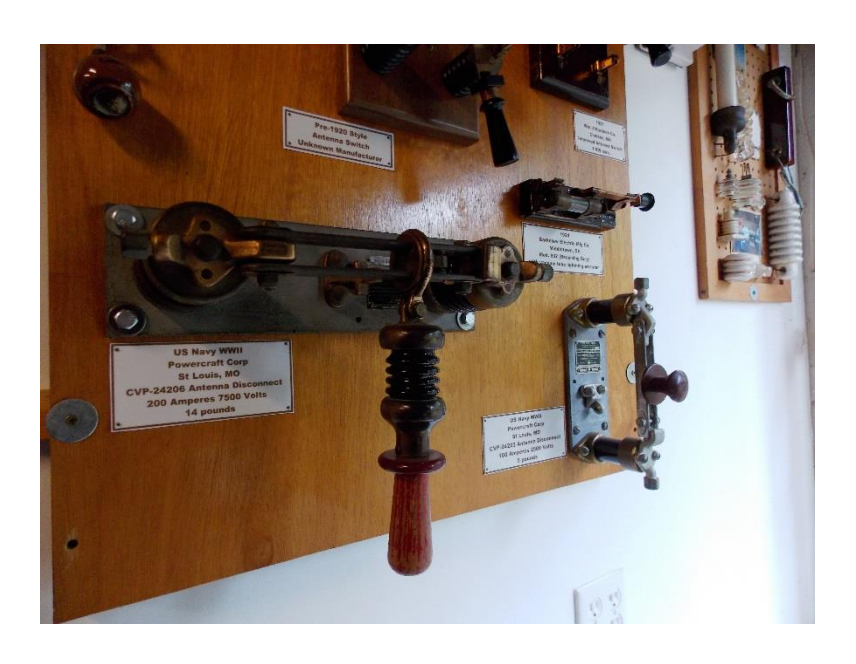
My antenna switch display. That's the CVP-24223 antenna switch on the right.