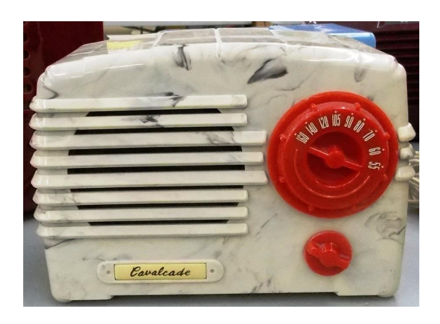
A brightly-colored Cavalcade - made in Canada