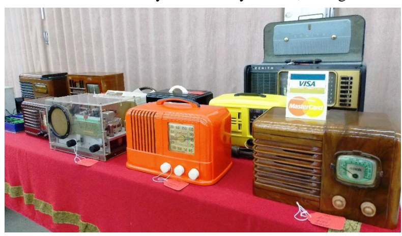
Nice variety of table radios. Gary Marvin Page 3