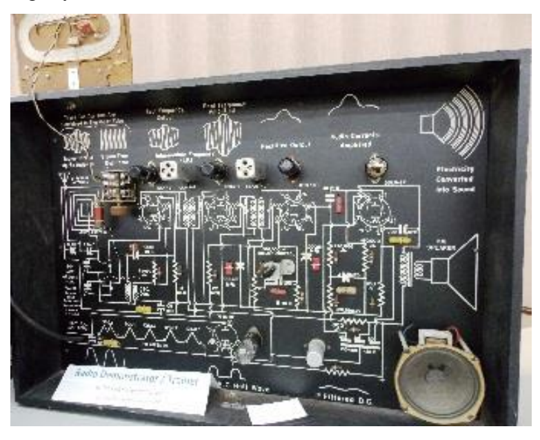
Radio Demonstrator / Trainer – A complete tube radio built into a shadow box! Blake Dietze