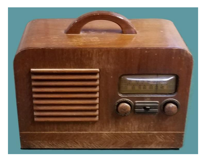
Ray Holland's '39 GM (looking for '42) Page 4