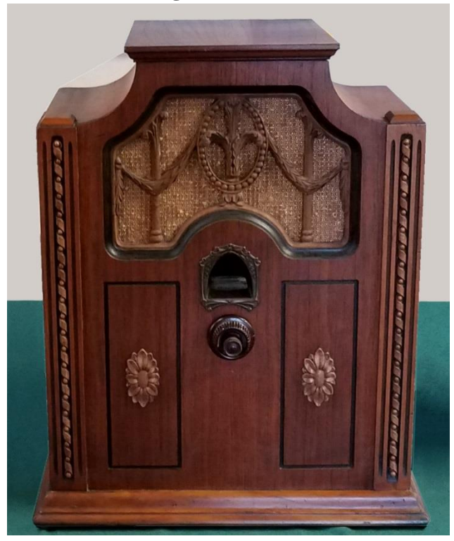
Larry Tobkin's 1931? Brunswick 6-tube Page 6