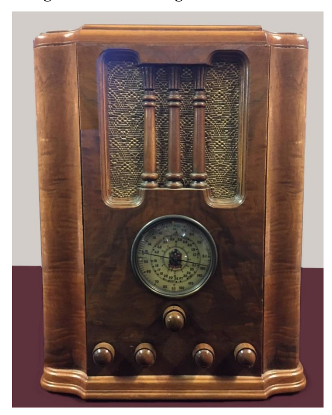
Blake's '36 - '38 9-tube 32V Delco