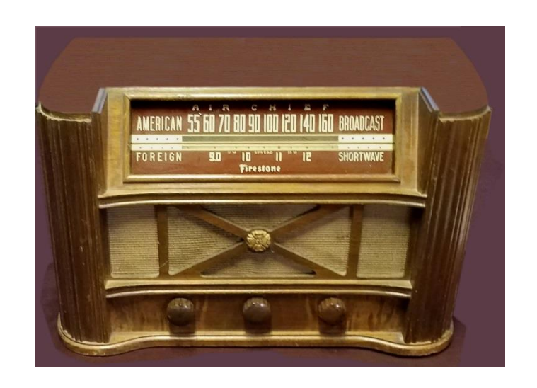
Brian Wegener's Firestone 4A-20