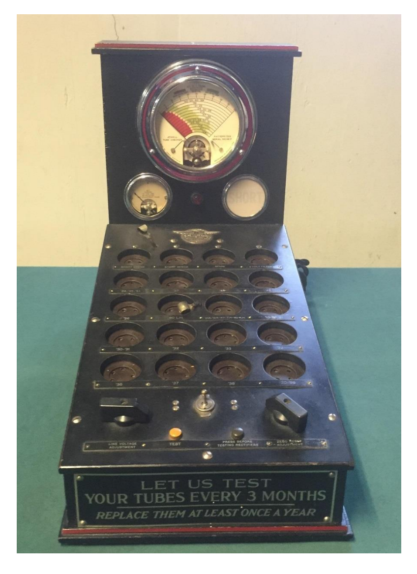
Radio City 310 tester with the post-war upgrade to test miniature and peanut/pencil tubes Larry Osborne Ph.D. (Ret.) KI7UFC