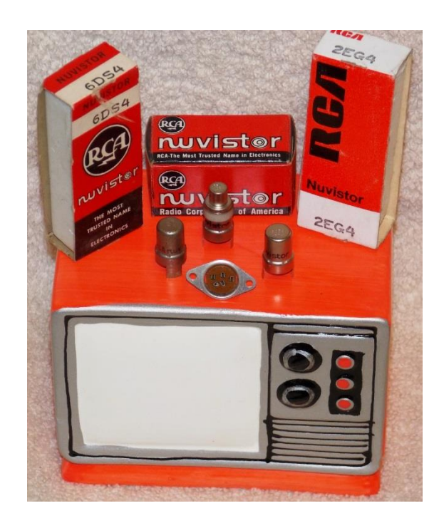
Figure 6: Nuvistors sit atop a toy TV

Despite the Nuvistor's ruggedness, authors advise using caution when testing them; some tube testers may apply a plate voltage that is too high. <sup>2</sup> Instead, they recommend replacing suspect tubes with ones known to be good.