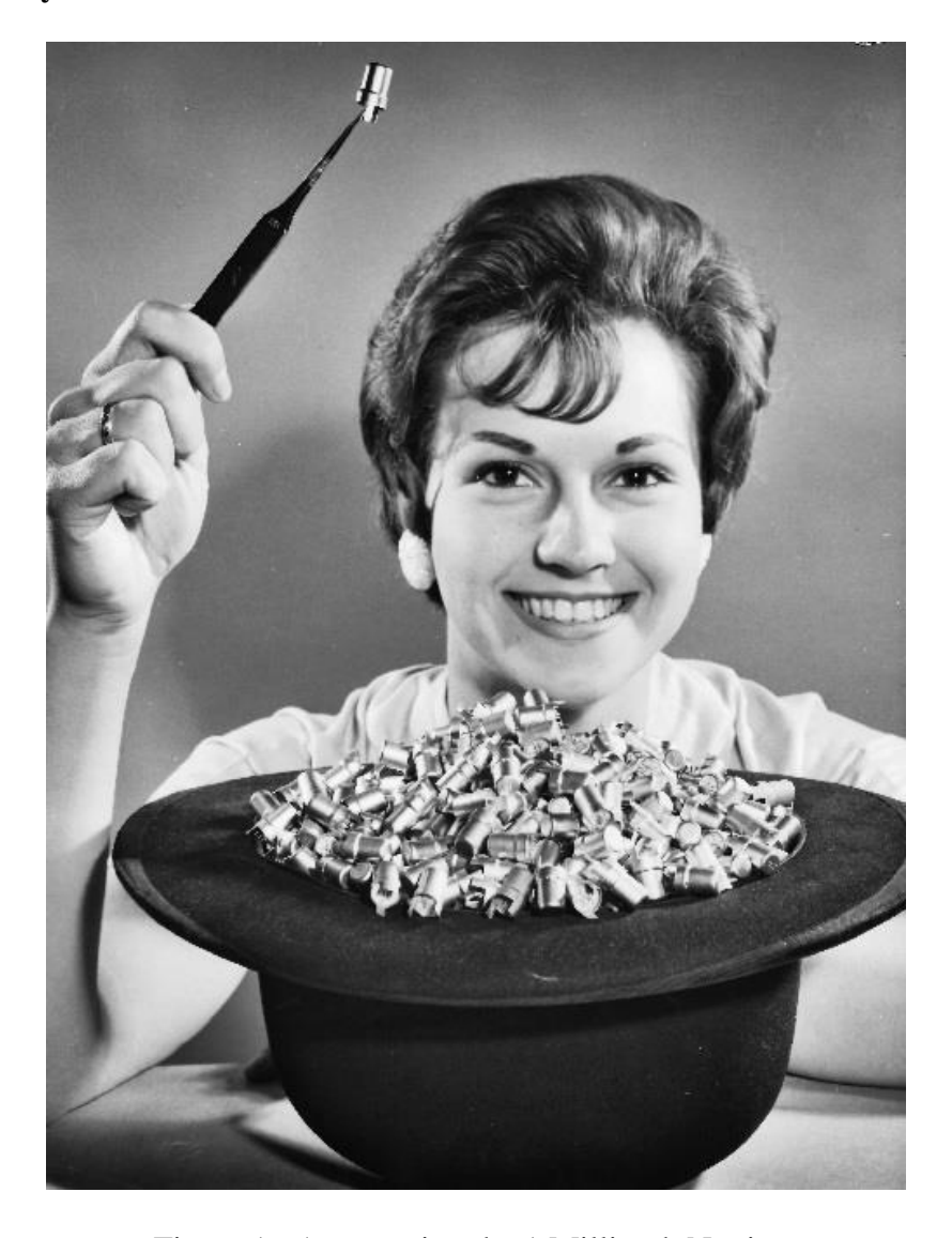
Figure 1: Announcing the 1 Millionth Nuvistor