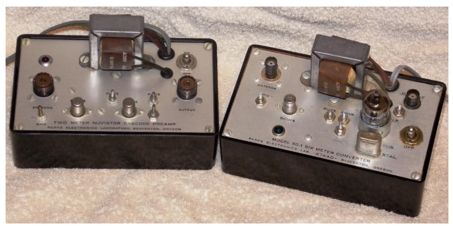
Figure 5: Parks Electronics Labs preamp and converter

Parks Electronics Lab in Beaverton designed ham equipment around them. Figure 5 shows two Parks items. The Two Meter Nuvistor Cascode Preamp on the left uses a pair of 6CW4 Nuvistors. The 50-1 Six Meter converter on the right uses a 6CW4 and a 6U4 glass miniature (shield removed). Note how the glass tube towers over the much-smaller Nuvistor. Other electronics manufacturers such as Heathkit, Ameco, Clegg and Lafayette also used them.