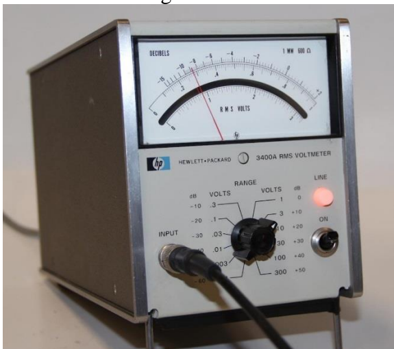
Figure 4: HP RMS voltmeter

Hewlett Packard also used Nuvistors in their test equipment. Figure 4 shows a Nuvistor-equipped HP RMV voltmeter used to measure AC voltage.