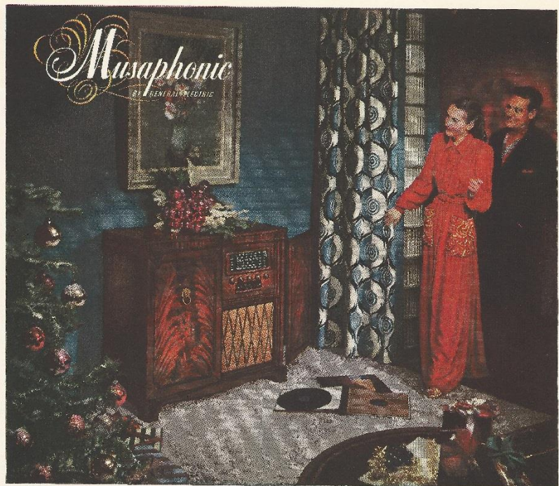
The Musaphonic shown above is the Berheley Square