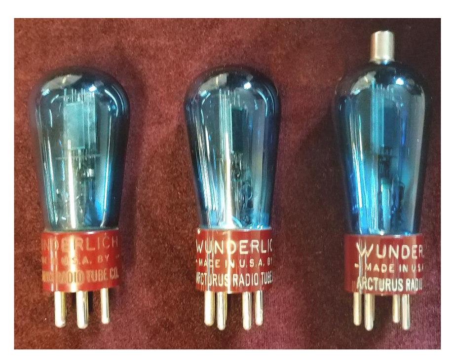
Tube of the Month - Wunderlich Tubes - Sonny Clutter