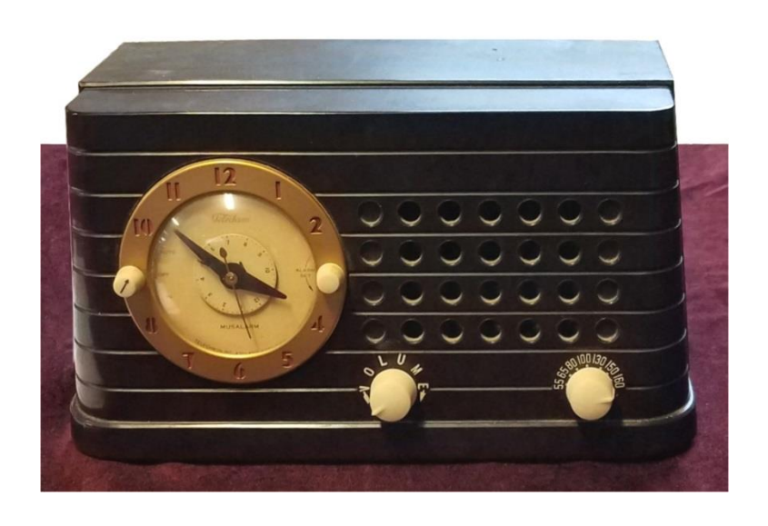
Telechron - Al Shadduck