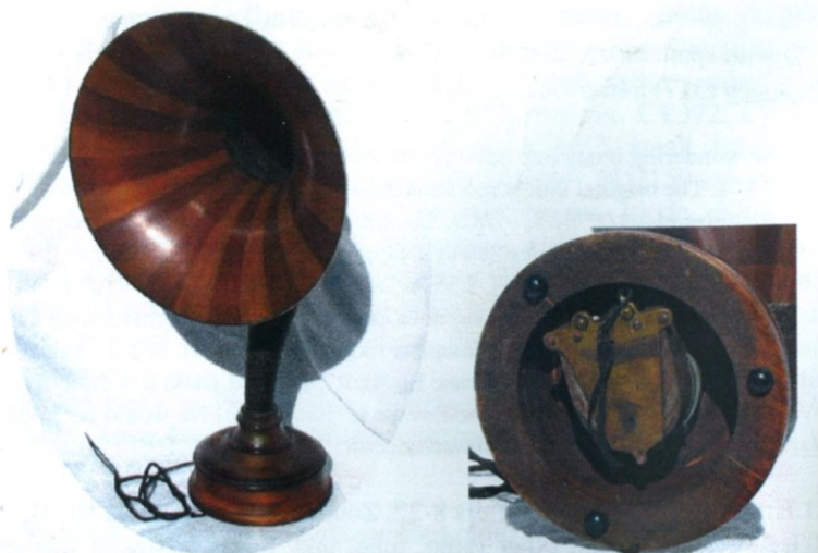
A thick base version using a large driver arm reproducer. No manufacture's name on the reproducer. Horn is identified as manufactured by the Radio Cabinet Company, Indianapolis.