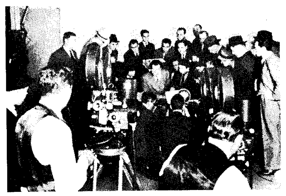
ORSON WELLES MEETS THE PRESS ON THE MORNING AFTER

home, listened to the broadcast and went straight to bed. It wasn't until the next morning when his barber showed him the morning headlines that Koch learned of the turmoil of the night before.