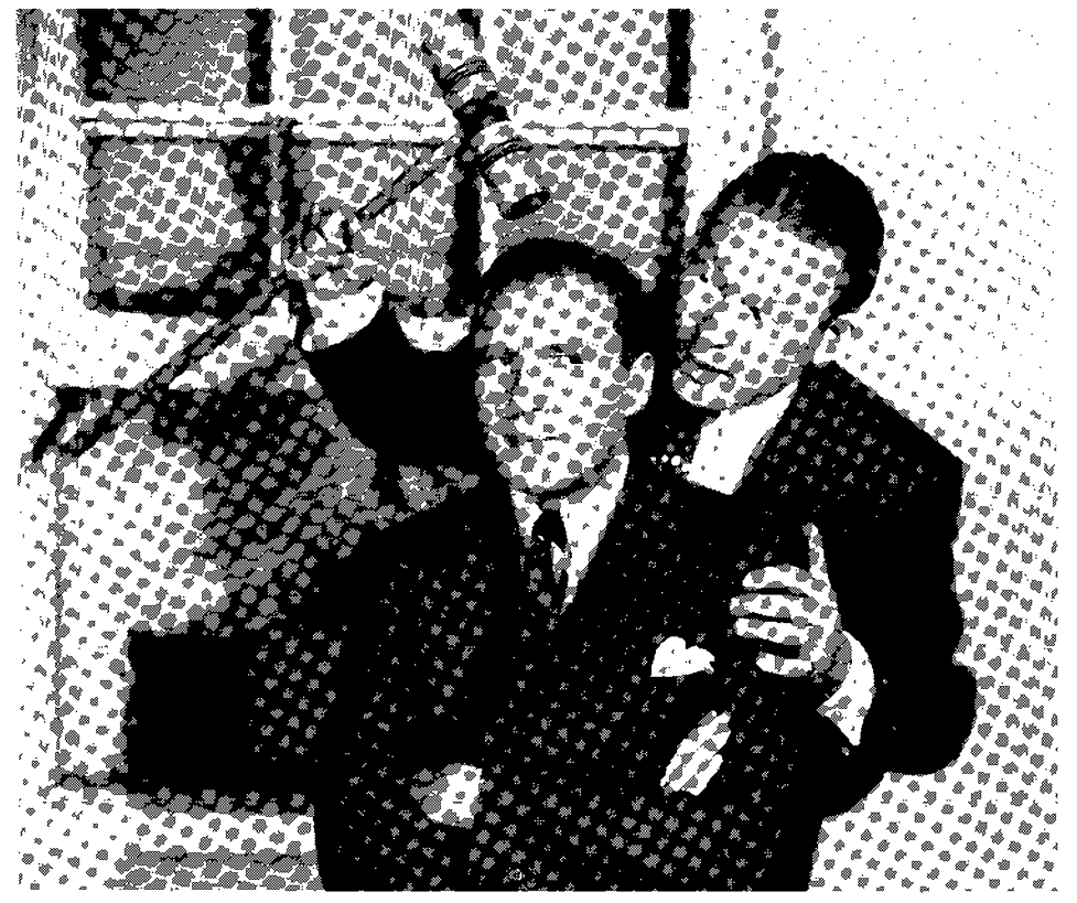
THE FAMOUS BENNY-ALLEN FEUD CONTINUES with this scene between Jack and Fred from the 1940 film, "Love Thy Neighbor."

Texaco in 1940, when the show changed to a less taxing half hour, but the program returned to one full hour in 1941.