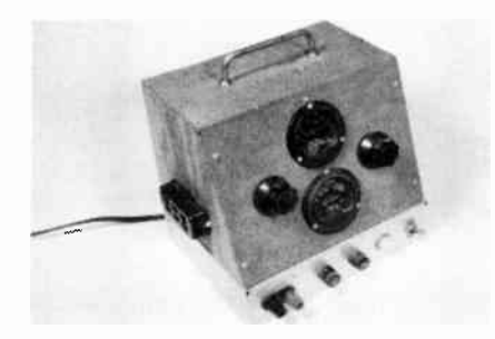
Home-made console contains isolation transformer for safe servicing of a.c. radios as well as charging circuit for small storage batteries.

Actually, you also need to be just as careful to avoid earth ground. A radio chassis can easily become connected to earth ground, either through a leaky bypass capacitor as already noted or via the shield lead of a piece of test equipment equipped with a plug having a grounding pin.