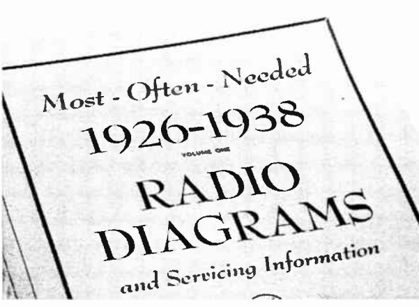
First volume in Supreme's "Most Often needed" series is commonly available, good starter book for beginners.

The proper Rider's reference is also shown for each set, as are two pieces