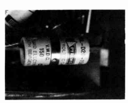
Even a set that's unplugged can give you a nasty shock if you don't discharge filter capacitors before working on it.

because they are physically and electrically larger than the other capacitors in the radio. Look for a large cardboard or metal cylinder, or possibly a couple of them, mounted on end above the chassis or sideways underneath it. You can remove the danger by discharging the capacitors.