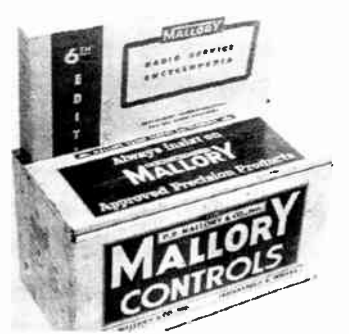
Mallory Radio Service Encyclopedia (6th Edition) slips into slot behind metal "control deal" box.

The 1931 perpetual, without updates, contains only 80% of the material in Rider's I. If all updates are included, you will receive all of the Volume I material and 70% of that contained in Volume II. When assessing the completeness of a 1931 Perpetual, remember that the page numbers cannot be used as a guide because update pages referenced the original page number. The only way to check is through estimates based on the measured thickness of the volume."