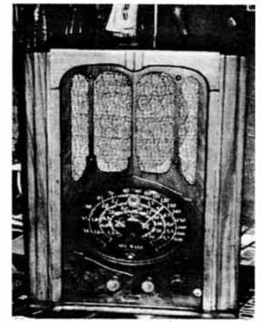
Can anyone help reader Humphreys find info on this very neat looking All American Products Corp Model # N.T.?

Stewart Humphreys, 600-C Brookwood Ct., Blue Springs, MO 64014 is looking for schematic and servicing information for an All american Products Corp. All Wave Model # N.T as pictured here. Tube complement is 5Z3, 6K7, 6L7, 6N5, 6B6, 6D6, 76(3), 75, 6U5. The set is apparently not listed in Rider's.