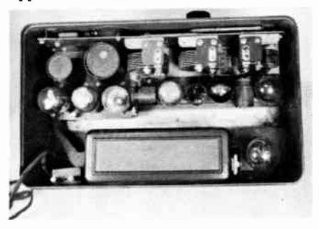
Development of new tubes allowed integration of a.c. power pack (at bottom) with radio circuitry.

The electronic innovation was the development of amplifier tubes (such as the pioneering type 26) designed to be lit from an a.c. source. This paved the way for the design of efficient plug-in power supplies (usually employing the type 80 rectifier tube) that made the use of batteries unnecessary, except for portable applications.