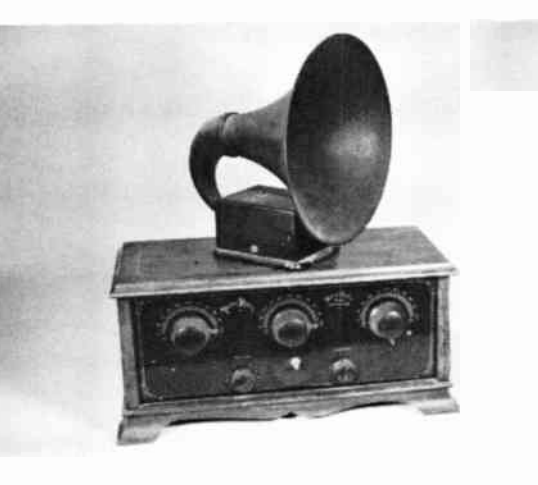
The "3-dialers" offered speaker volume, improved expanded and the radio dial selectivity. They were made in great quantities.

But battery eliminators didn't do much to simplify the radio installation. Usually, at least two separate eliminators were required to provide necessary