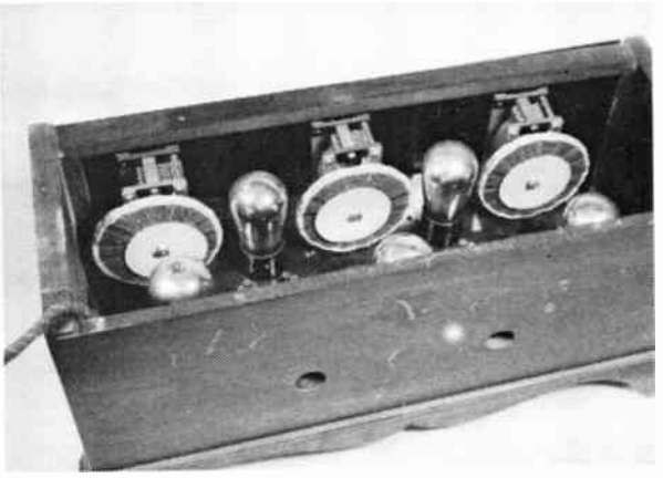
TRF circuitry required the use of three r.f. coils, It required three tubes (two r.f. each tuned by a separate variable capacitor.

Though three-dial tuning was certainly a clumsy procedure, the simpler regenerative sets were more cranky and difficult to keep in adjustment. And as it turned out, the TRF's additional tuned circuits provided extra selectivity, which became very desirable as the broadcasting industry