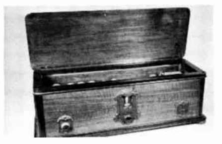
RCA's first plug-in superhet, the Model 60, had "throwback" coffinshaped case.

Unlike the TRF receiver (which amplifies the incoming r.f. signal at whatever frequency it happens to be received), the superheterodyne converts every incoming signal to a standard, much lower, frequency prior to amplification. By amplifying at this lower frequency (known as the intermediate frequency), greater gain can be obtained without danger of oscillation and greater selectivity can be achieved.