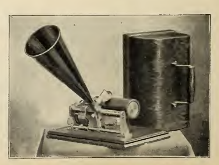
The Eagle Talking-Machine, $10.