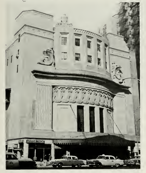
New York's fomed Ziegfeld Theatre — now a color TV studio.

IN EW YORK'S historic Ziegfeld Theatre, worldfamous for many years as the home of spectacular stage presentations, has been converted by the National Broadcasting Company into a unique color television studio in which the tradition of the famed theatre will be carried on in the electronic era.