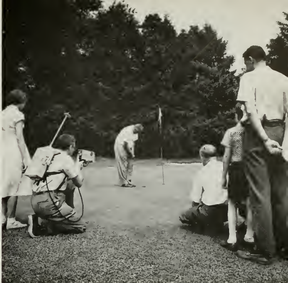
With transmitting range of more than a mile, the partable unit can pick up and send TV signals to base station for network broadcast to provide coverage of outdoor events as shown in this picture.