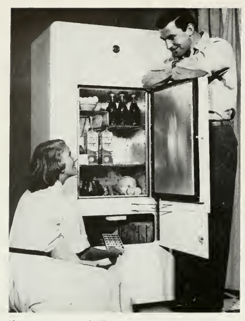
The new, impraved electronic refrigerator is demonstrated by models at RCA's David Sarnoff Research Center. Food compartment has capacity of 4 cubic feet: ice tray, at bottom, measures 30 cubic inches.

running time to phonograph records, from tape only \frac{1}{4} -inch wide. The tape selections are recorded on the previously-developed RCA magnetic tape recording system for black-and-white and color television. Already under way is the next step — reproduction of prerecorded "hear-see" tape selections in color.