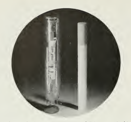
At heart of RCA's new transistorized TV comera is this RCA-developed ½-inch Vidicon tube, shown here in comparison with a king-size cigarette. Tube is now being produced in sample quantities.

cigarette, and employing any standard 8-mm motion picture camera lens. According to Mr. Flory, the miniature tube, in spite of its small size, has a sensitivity greater than that of the standard 1-inch Vidicon pickup tube commonly used in portable TV camera. The tube, employing an improved light-sensitive surface, was developed by A. D. Cope, of the research staff at the David Sarnoff Research Center.