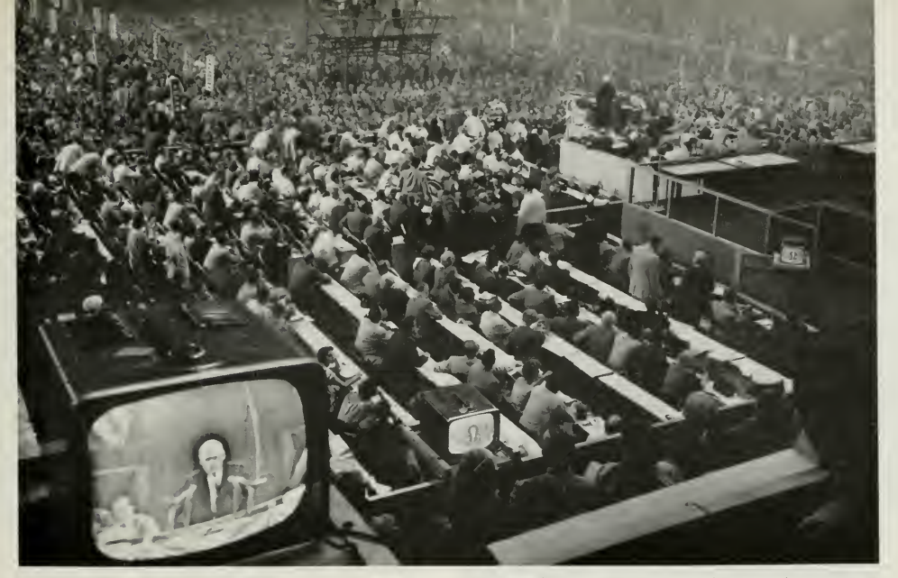
Monitors placed strategically on the convention floor provided extra view of proceedings at Chicago.