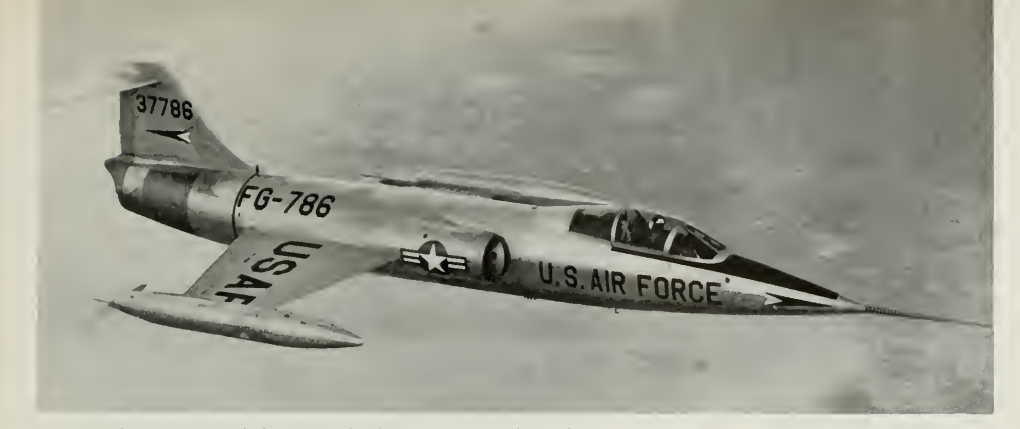
RCA equipment helps to guide the F-104 Starfighter, shown in flight in this U. S. Air Force photo.