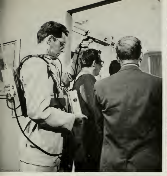
The new RCA transistorized TV camera-transmitter unit features detachable electronic view-finder which enables cameraman to hold camera above eye level and still see the picture he is getting.