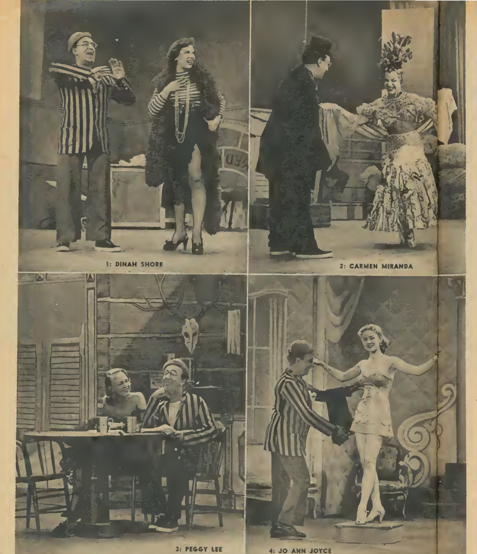
CBS's Ed Wynn Show usually features a smooth-looking gal who is broken up by Ed's elequent eyes long before he opens his mouth.