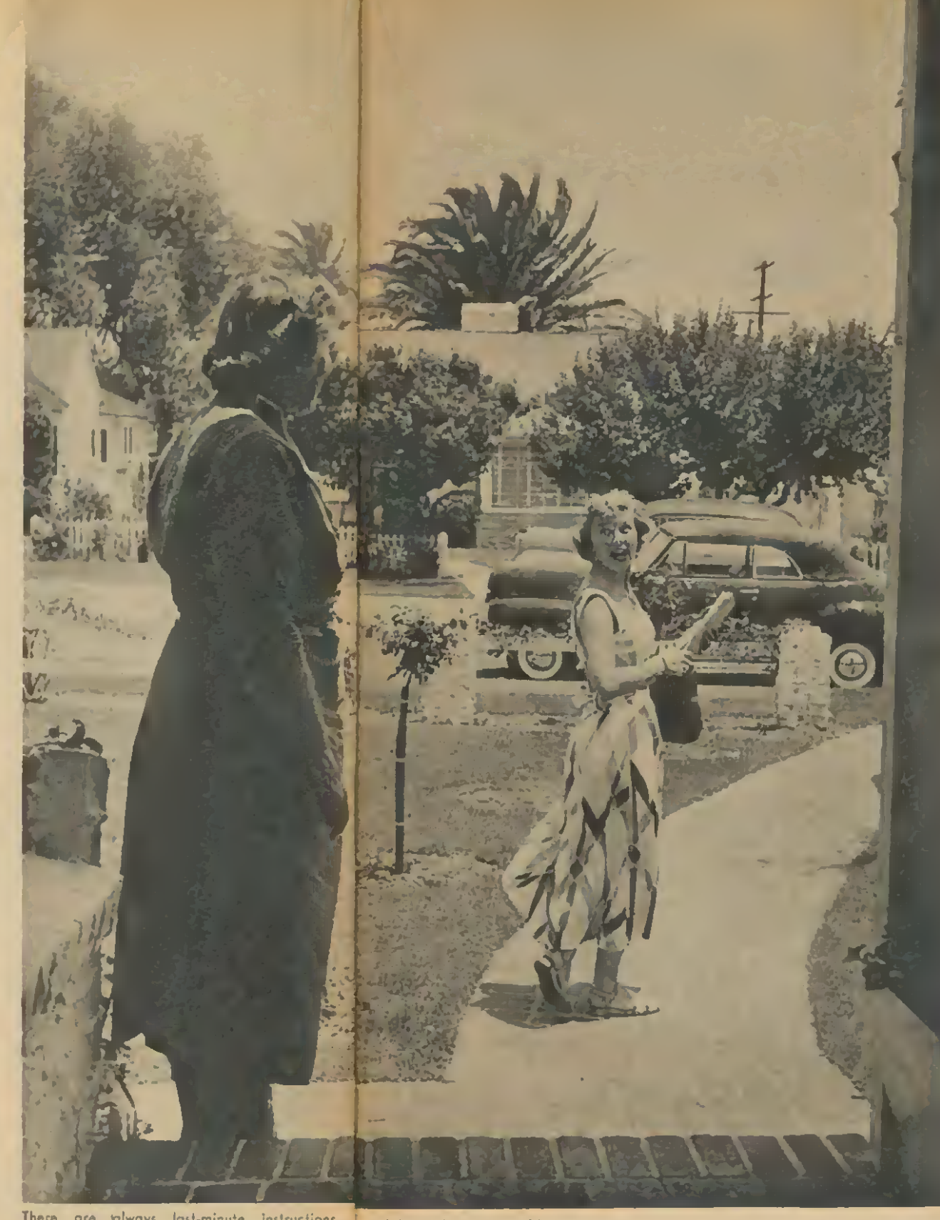
There are always last-minute instructions.