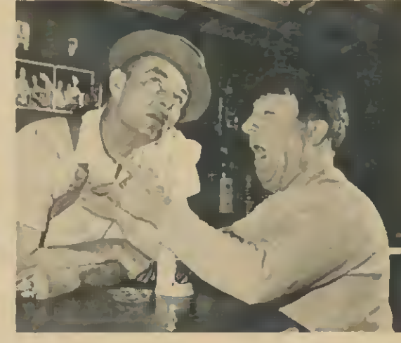
4. Finnegan gets sentimental, and, overcome with the beauty of the moment, tells Archie how he loves him like a brother. Archie wonders if he should disown his family.