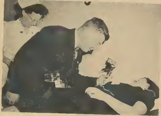
During the wor, he helped collect 6,000 pints of blood for wounded fighters. Here, he broadcasts with a donor.