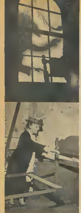
"DEATH" hovers over the sick boy's bed—bedpost, a window, the actress's hands.