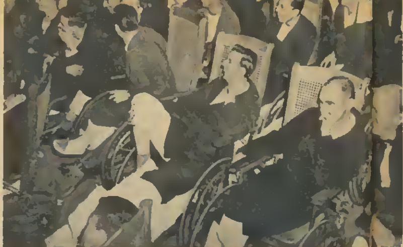
Expressions on these faces tell the story of Grand Ole Opry abroad.