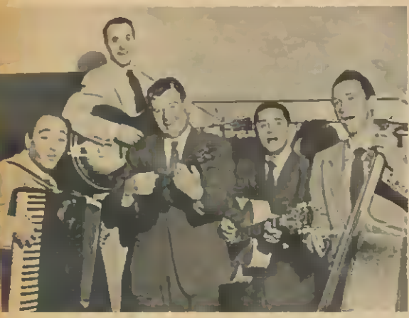
Characteristically casual with The Vagabonds.