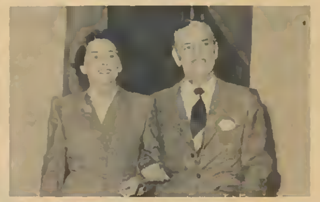
MR. & MRS. PREXY: The R. Colmans of H'wood are now "The Halls of Ivy," a distingue college prez every Friday night at 8.

STATEMENT OF THE OWNERSHIP, MANAGEMENT, CIRCULA-TION, ETC., REQUIRED BY THE ACT OF CONGRESS OF AUGUST 14, 1912, AS AMENDED BY THE ACTS OF MARCH 2, 1933, AND JULY 2, 1946