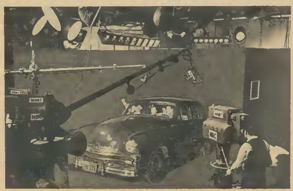
The storm scenes are filmed in a warm and cozy television studio, with a $15,000 camera, no less:

Visual effects are to video what sound effects are to radio, and on this page you see how some of them are accomplished. One of the director's most important jobs is to keep the mike from casting a shadow on the players' faces, and to keep the mike as unobtrusive as possible. (Note the wire inserted in the car door, but the mike itself is wellcamouflaged.) Lighting is getting better all the time. Originally, television actors nearly cooked under incandescent lamps, but cooler systems have solved this problem. Extreme television makeup, involving green rouge and black lipstick, has-with improved lightinggiven way to light make-up, and for some shows the actors wear none at all. Television is becoming a full-fledged art.