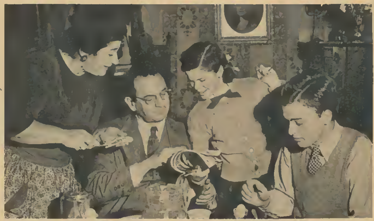
A two-decade veteran on radio, that warmly humorous cross-section of life seen from the window of a Bronx apart-