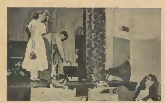
Minnie Pearl heard a familiar 'Howdee' from 200 hospitalized saldiers at Berlin's 279th Station Hospital,