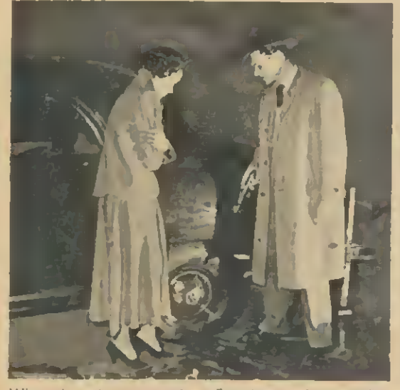
When they stap to repair a flot tire on the car, the old lady vanishes, only to reappear at the Gaines' home, mysteriously involved in their son's illness.