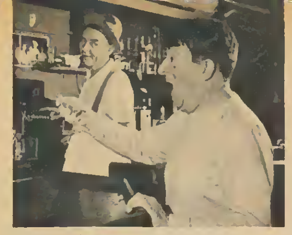
1. "Gimme a drink, Archie old boy. You and 1 are going to have a lil celebration. Ya know, I been coming here for eight years and I want you to know I'm your loyal friend."