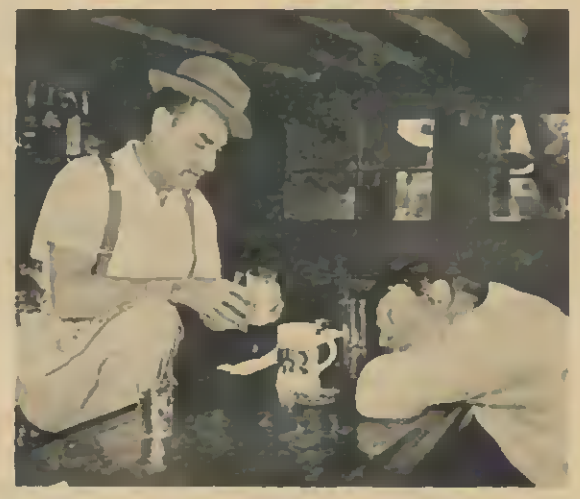
6. Archie the long-suffering bartender says he'll fix him up this time, but never again. Poor Finnegan simply wants to know "Can anything help me now?"

Finnegan's decided to have a quiet celebration at Duffy's Tavern on its ninth radio anniversary but—Archie won't play.