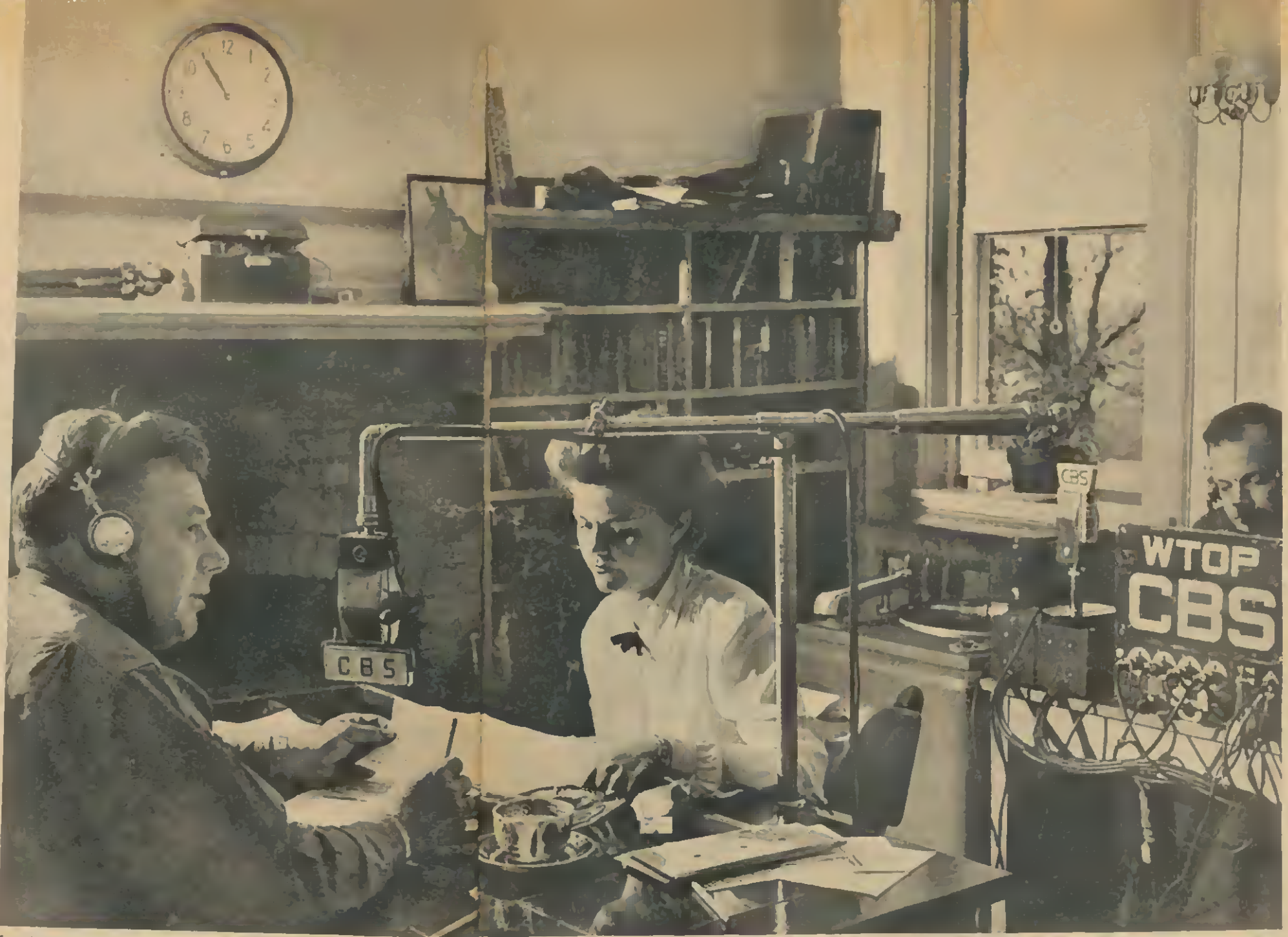
Even in the early broadcasting days, Mug compiled Godfrey's notes.