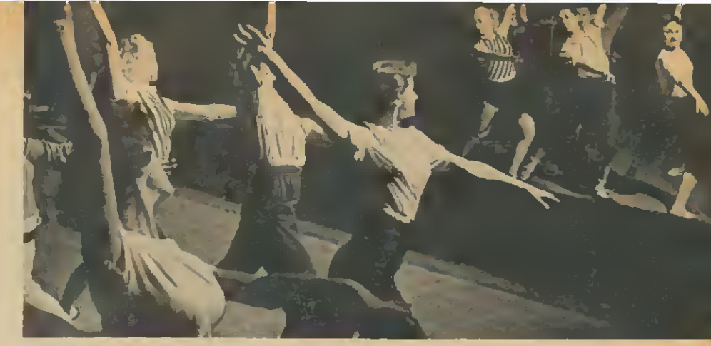
The "Toastettes" first charus line have a final practice session before mirrors.