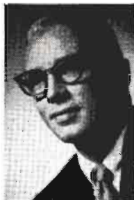
By RAY STONE Broadcast Supervisor Maxon, Inc.

B UYING radio time from seven to nine o'clock in the morning is not unusual these days. It now appears that the advantages of early morning radio were concealed for many years. It is probable the present advantages of FM radio are also concealed by various broadcasting industry problems which result in the practical evasion of FM radio by most national advertisers.