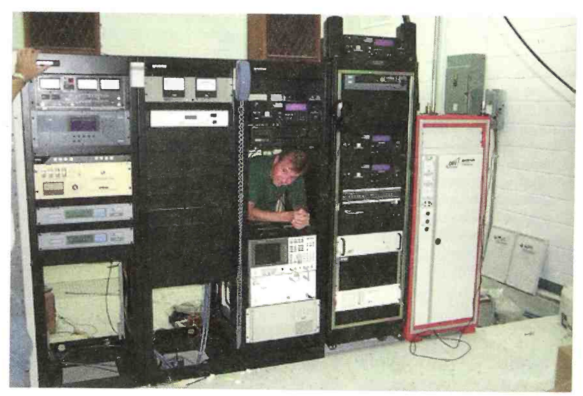
Walden strikes a pose behind the FM IBOC installation at WMMO in Orlando before the radio show.

Are you testing the data channel for FM and AM in these rounds of tests? What are the details if so? In all of our tests we include Program Associated Data, PAD. We are performing tests on auxiliary data. how-