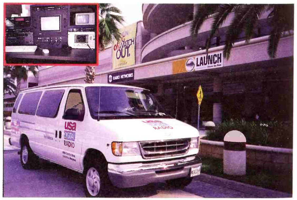
The USADR van ready for riders at the NAB Orlando Radio Show. Inset: equipment inside.

In my 10 years of working on digital radio, I have seen a number of IBOC designs. I believe that this system represents the most thorough and complete design possible for an IBOC